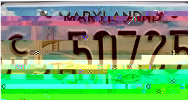
Example: Ž H