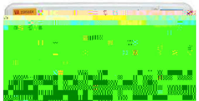
Example: „ GT 9