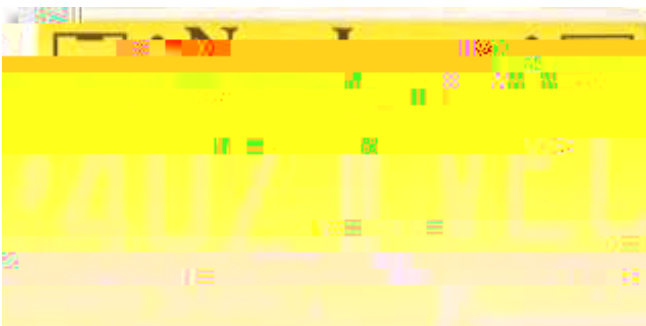
Example: „ EŽ Z